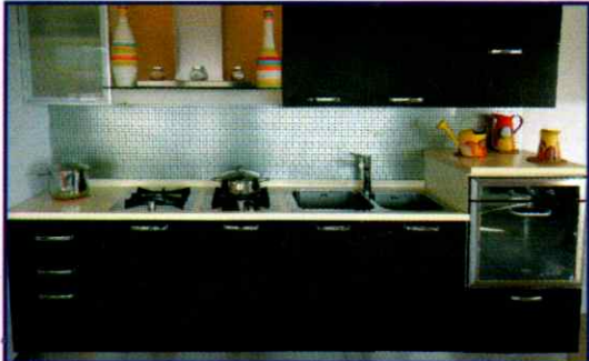
Ventilated kitchen spaces