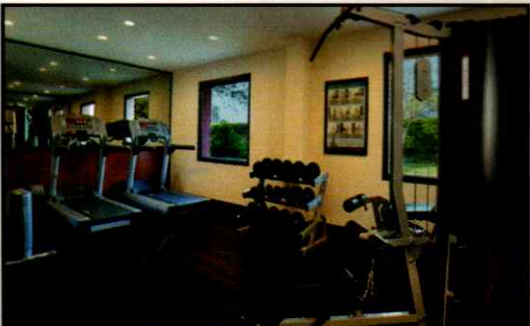
Excellent gym facilities

Abutted on one side by the Eastern Express Highway the project is 15 minutes walk from the Mulund Railway Station (east). This Multistoreyed Maserpiece Offers Shops & Parking on Ground level, exquisitely designed 2 & 3 BHK Luxurious Apartments offering Premium Amenities and Facilities.