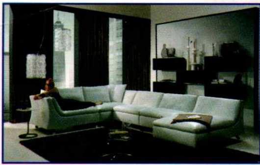
Spacious living spaces