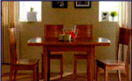
Well designed dining spaces