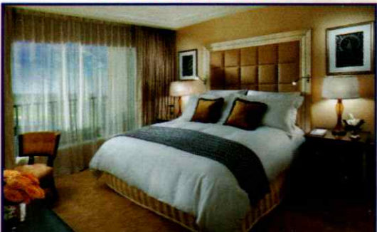
Comfortable bedroom sizes